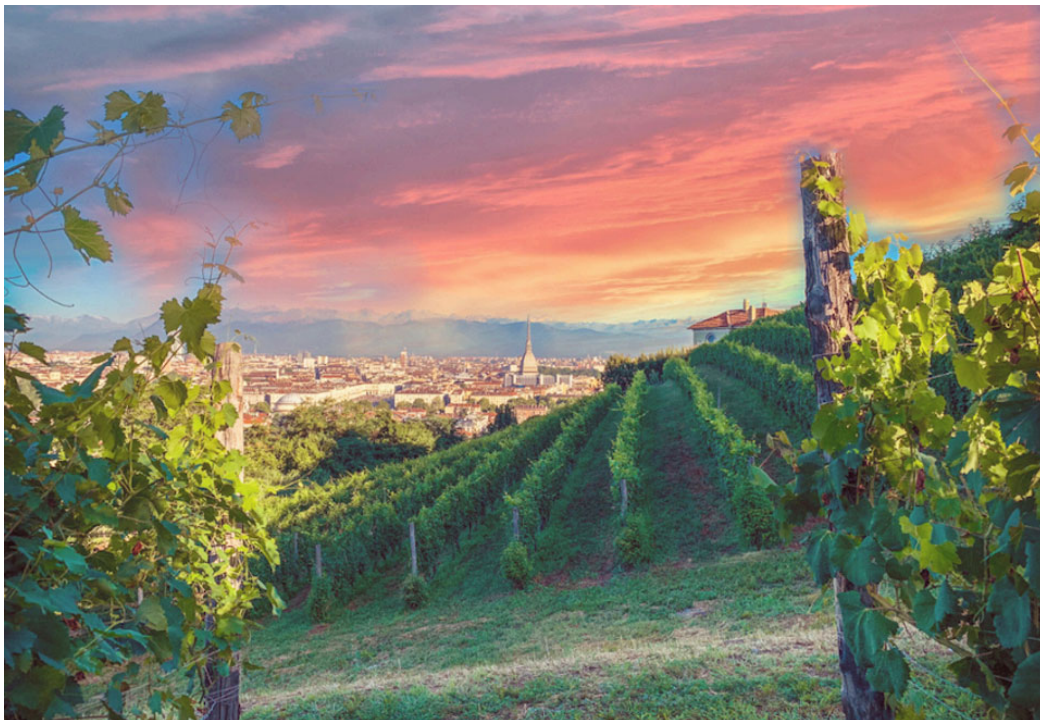
The Vigna della Regina vineyard overlooking Turin.

[Updated 8/1/2020**] As a country with a notably diverse landscape, Italy offers vineyards in locations ranging from the gently rolling hills of the Chianti and gravity-defying terrain of the Cinque Terre to Mt. Etna's dramatic slopes and the Alpine turf of Aosta and Alto Adige. But the most unexpected place to