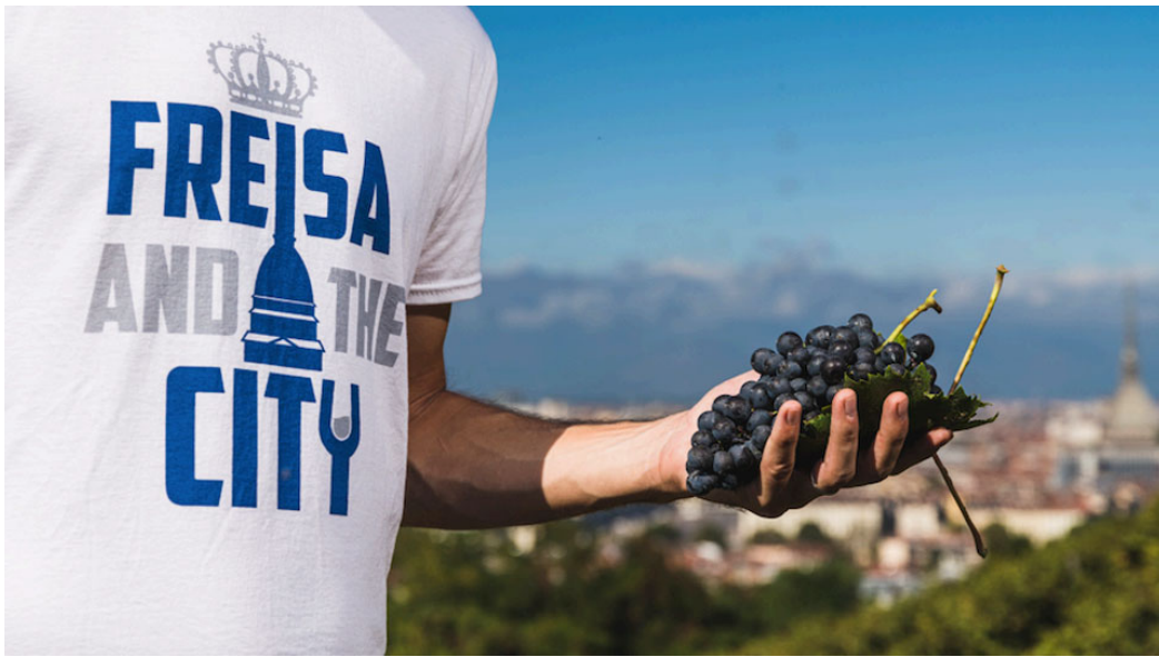
The Freisa grape.