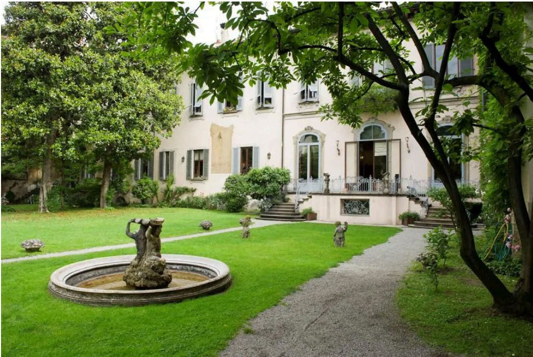
The 15th-century Casa Atellani in Milan, once home to Leonardo da Vinci, where he maintained a... [+]