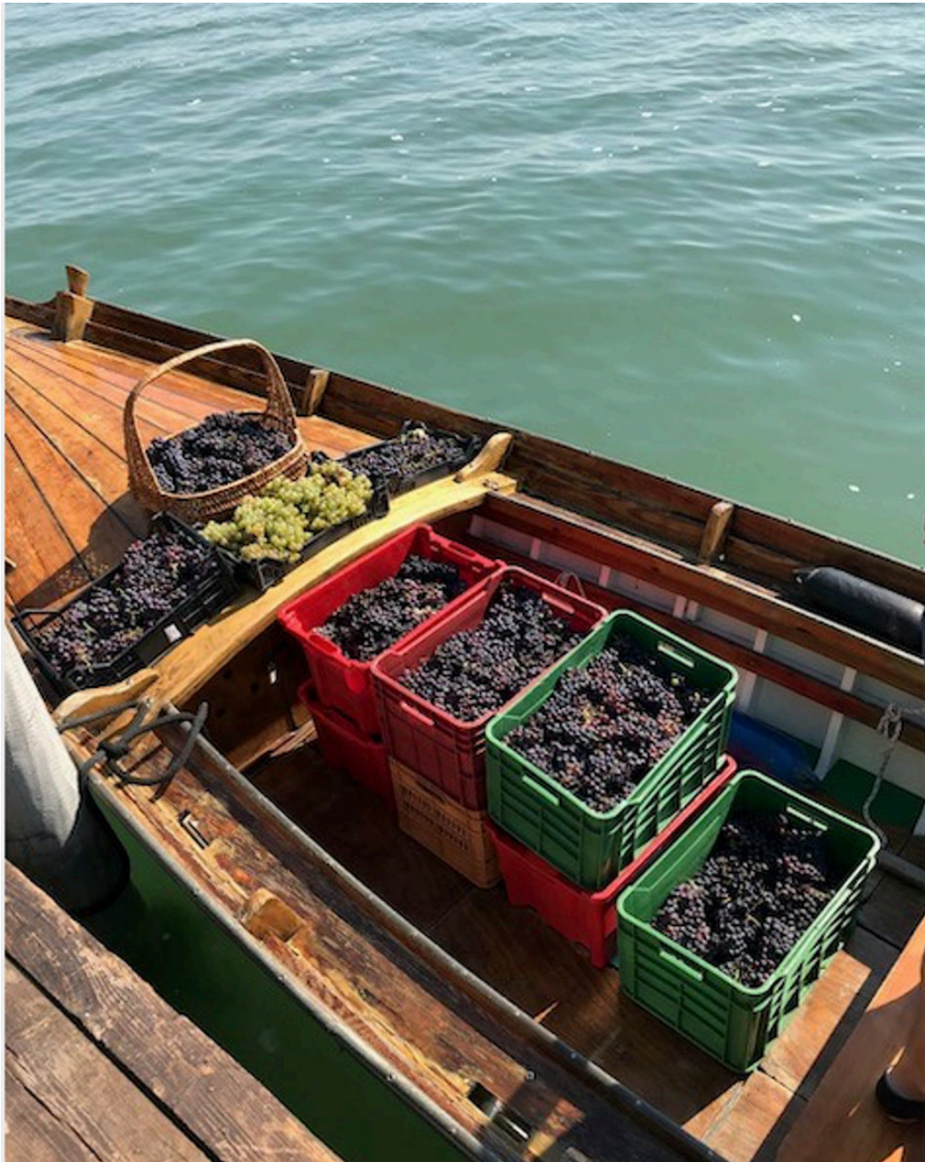
Grapes from a Vigneti della Laguna harvest in Venice.