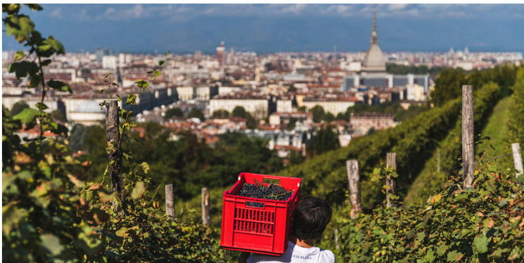
Harvest time at the Villa della Regina.